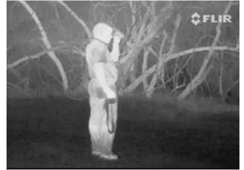
"White hot" image of the PS24 being used.

"FLIR PS24 revealed a few elephants feeding within 100 yards of the campsite. They were very relaxed and, in this case, not the slightest bit disturbed by our presence. The FLIR Systems thermal imaging camera helped us to see without being seen ourselves." said Powell.