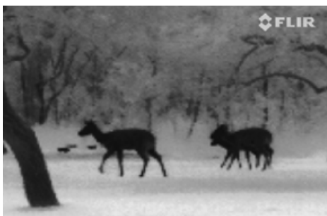
"Much to my surprise, despite not having heard the faintest whisper, there were several impala grazing on the lawn just 40 yards from where I was sitting".

"On other occasions, we knew from the noise around us that there was something out there, in the dark, but we had no idea what." Powell concludes: "Another use for the equipment was to enhance our safety. If you need to go out of the tent or lodge during the night, it can be reassuring to check the neighborhood for hyena before you leave."