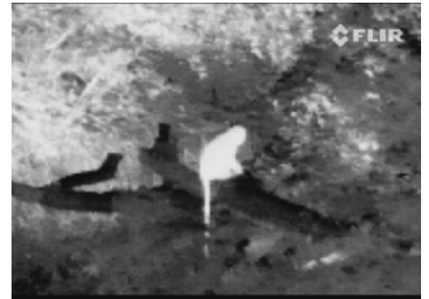
Vervet monkeys are a commonly seen around the campsites.