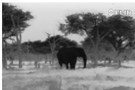
"FLIR PS24 revealed a few elephants feeding within 100 yards of the campsite".

For more information about thermal imaging cameras or about this application, please contact: