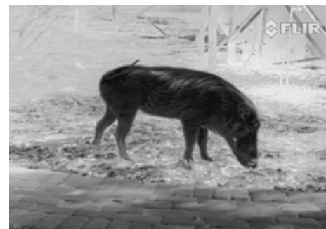
"Black hot" thermal image of a warthog.